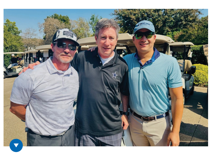
North Oak Cliff Greenspace Golf Tournament