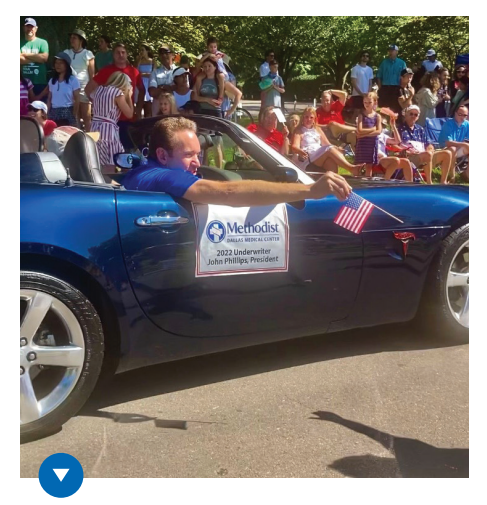
Rotary Club of Park Cities 4th of July Parade

A nonprofit 501(c)(3) organization, Methodist Health System is affiliated by covenant with the North Texas Conference of the United Methodist Church. To support any of Methodist's vital healthcare and community programs, call Methodist Health System Foundation at 214-947-4555 or visit MethodistHealthSystem.org/Foundation.