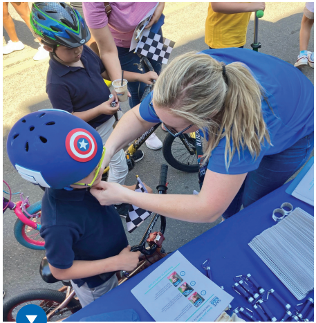
iBike Rosemont hosted by Rosemont Dads Club